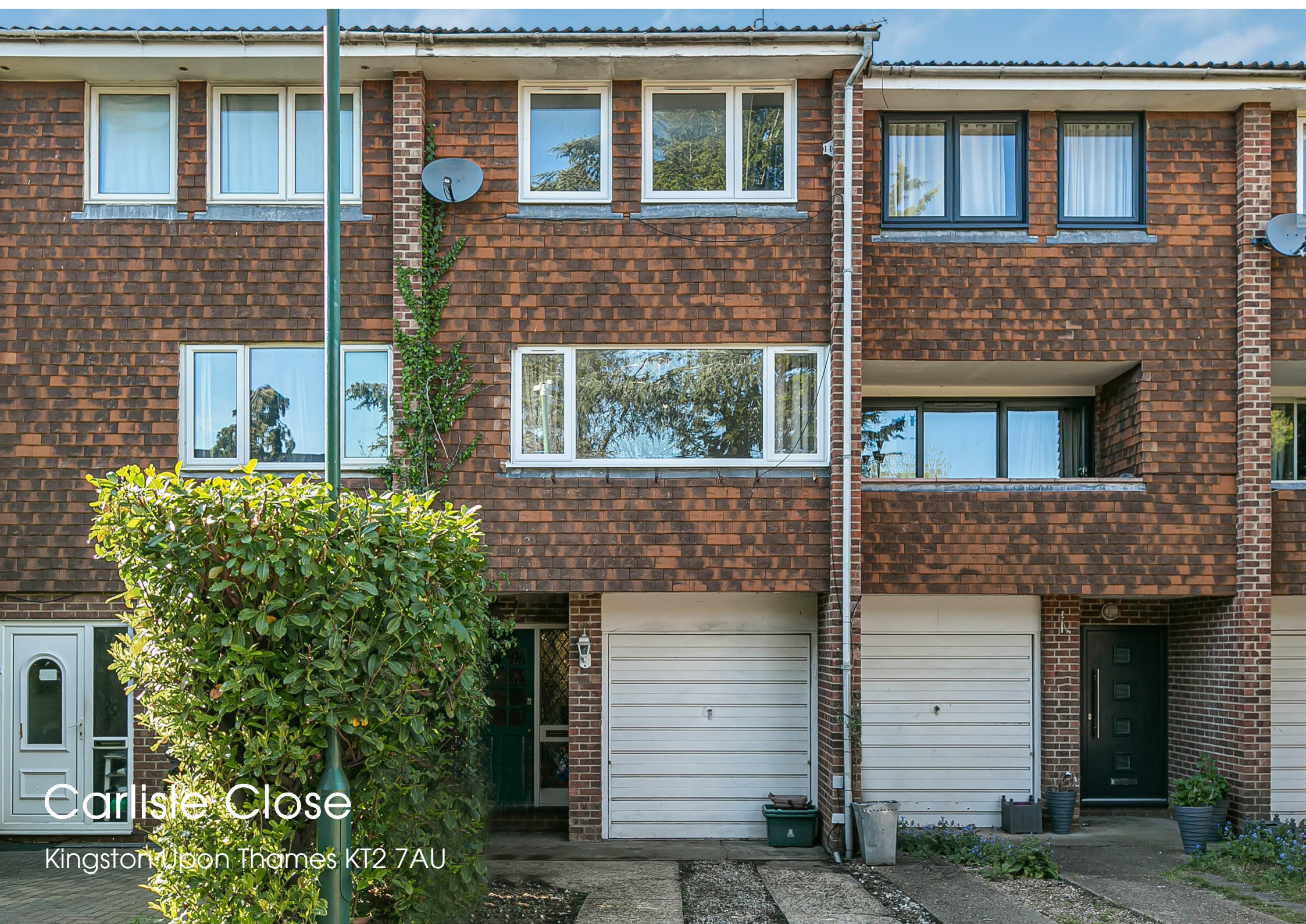
Carlisle Close Kingston Upon Thames KT2 7AU